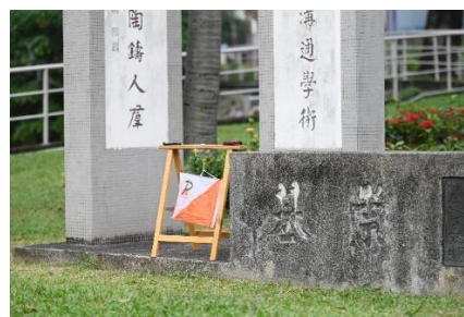
Control points shown on map